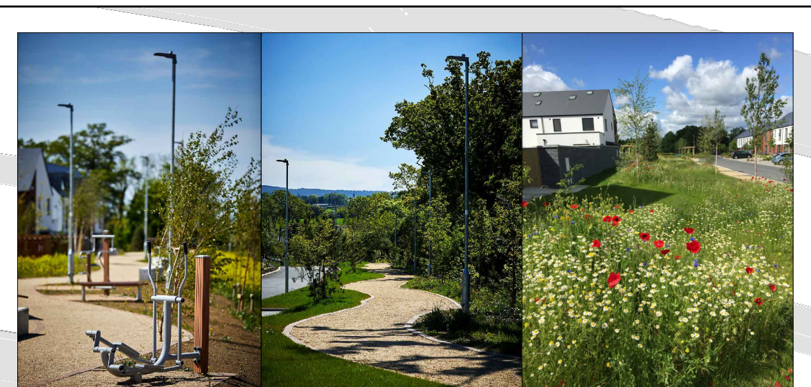
Gym equipment along northern boundary recently complete and opened by Ardstone at White Pines North to be continued into this scheme Woodland Boundary along northern boundary recently complete and opened by Ardstone at White Pines North to be continued into this scheme Wildflower meadow in the central spine recently complete and opened by Ardstone at White Pines North to be continued into this scheme