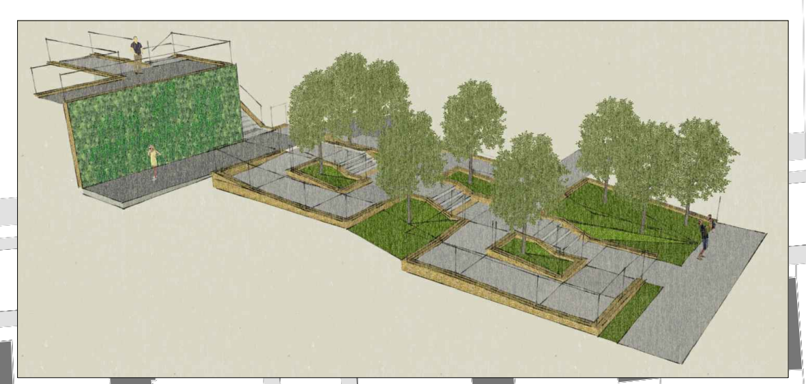
Proposed Circulation Space Between Block A and B Including Steps, Ramps and Green Walls