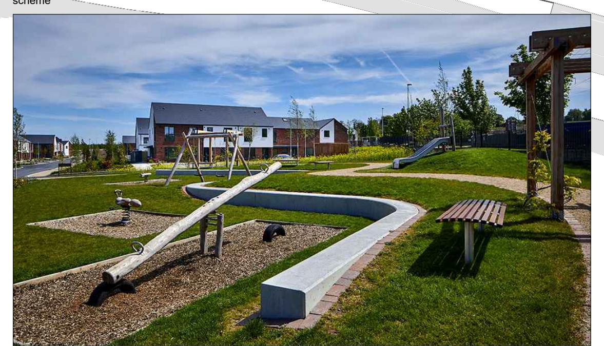
Playground Recently Complete and Opened By Ardstone at White Pines North